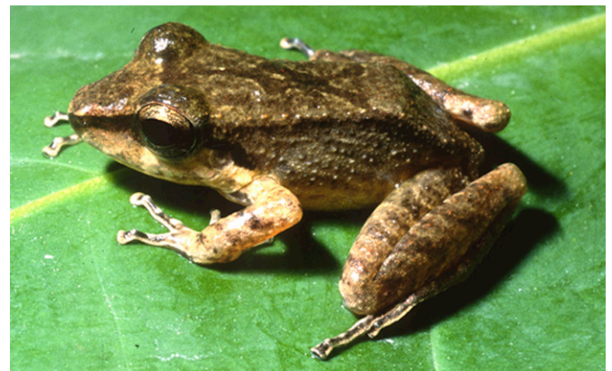
FIGURE 1. Dorsal view of a subadult Pristimantis citriogaster (QCAZ 17023) collected in General Leonidas Plaza (Limón), Provincia Morona Santiago, Ecuador.

The Ecuadorian specimens agree with the descriptions of P. citriogaster by Duellman (1992), Duellman and Pramuk (1999), and Duellman and Lehr (2009), are characterized by skin on dorsum shagreen without tubercles; indistinct dorsolateral folds; skin on venter smooth; tympanum distinct, round; first finger longer than second; fingers lacking lateral fringes or keels; ulnar tubercles present distally; tubercles absent on heel and tarsus; toes barely webbed basally, lacking lateral fringes or keels; posterior surfaces of the thighs mottled dark brown and cream; flecks on throat and ventral surface of thighs. The characteristic bright yellow belly of P. citriogaster in life could not be verified because only photos in dorsal view of live specimens were available. In contrast with Duellman and Pramuk (1999) report of a round palmar tubercle (shared only with P. zeuctotylus within the P. conspicillatus species group), the Ecuadorian specimens have a bifid palmar tubercle, which would be at the extreme of the variation reported in the original description of P. citriogaster by Duellman (1992): "the palmar tubercle could be large,