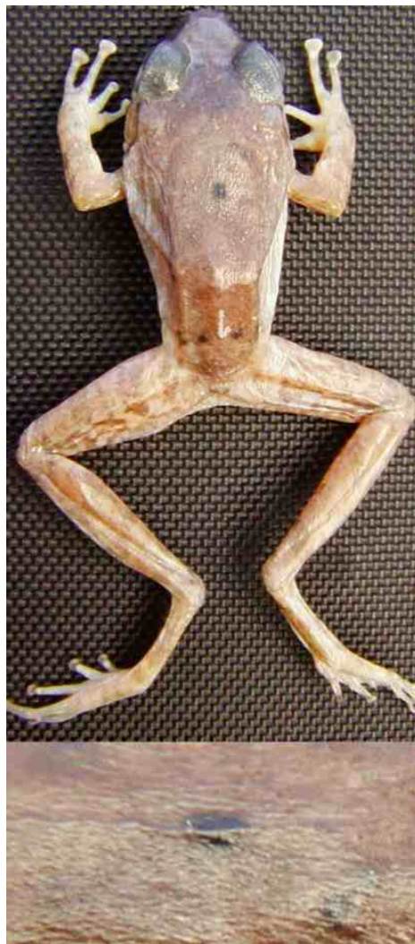
Figure 1. Dorsal view of Eleutherodactylus skydmainos (adult male, DFCH-USFQ W201) collected at the Tiputini Biodiversity Station, province of Orellana, Ecuador; below, a detail of the fin-like middorsal tubercle.

skin texture of posterior and lateral margins of the belly, a fin-like middorsal tubercle on a bold black spot, and a poorly-elevated interocular fold. Further, they have tarsal folds, a pair of dorsolateral ridges (low in the adult specimen as an artifact of preservation, but conspicuous in life), immaculate venter, and basal toe webbing. The combination of all of these characters clearly separate E. skydmainos from the other sympatric species of the E. conspicillatus group: Eleutherodactylus conspicillatus , E. malkini , and E. peruvianus .