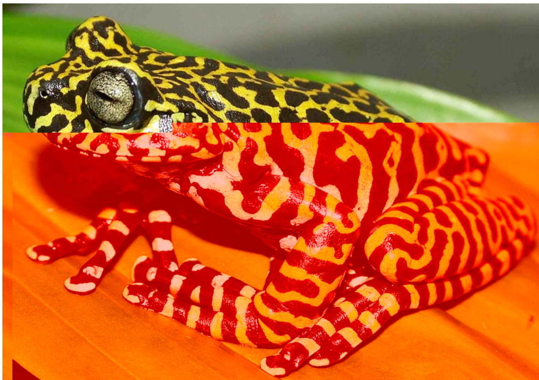
Figure 1. Adult female Hyloscirtus tigrinus (ICN 54635, 62.9 mm SVL) from Laguna de la Magdalena, department of Cauca, Colombia.

recorded only at the type locality; however while carrying out field work at Laguna de La Magdalena, Puracé Natural National Park, department of Cauca, the senior author collected an additional specimen of H. tigrinus (Figure 1), extending the geographic and altitudinal range of the species.