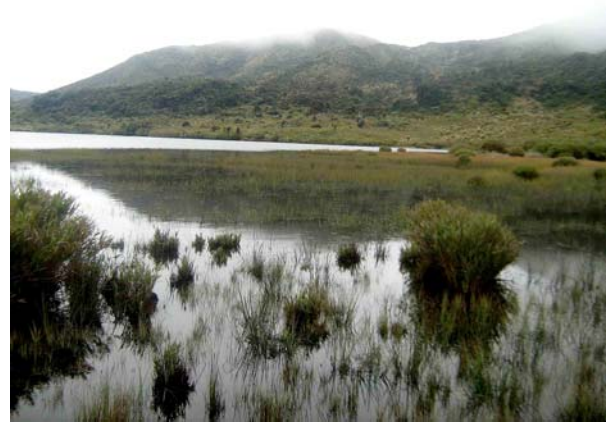
Figure 2. (A) General aspect of the Laguna de la Magdalena, and (B) of the habitat where Hyloscirtus tigrinus was found.

of upper montane Andean forest next to a small stream (Mueses-Cisneros and Anganoy-Criollo 2008).